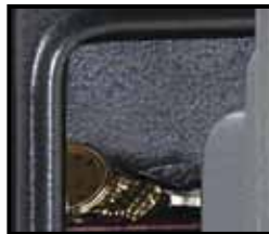
Removable storage shelf

Protects documents from fire in temperatures up to 1700° F / 927° for one hour