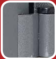
Heavy duty steel hinges