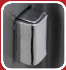
4 locking door bolts