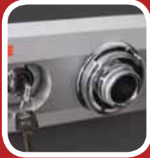
Spy-proof dial hides combination from onlookers

1.22 cubic feet internal storage capacity