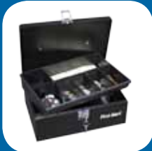
Removable 7-compartment cash tray (Additional storage underneath)