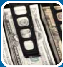
Equipped with spring clips that hold bills to top lid