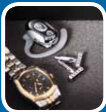
Protective floor mat