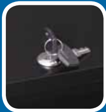
Key lock (2 entry keys included)