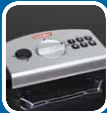
Programmable digital lock with emergency override key