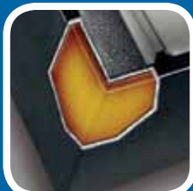
Insulated double steel wall construction