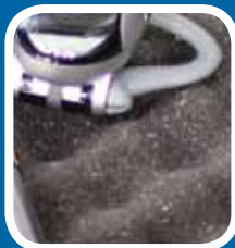
Protective floor mat