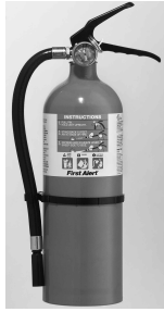
Heavy-Duty Fire Extinguisher Model FE3A10GR